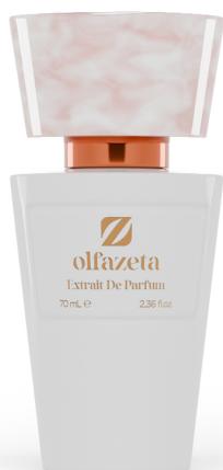
PHOTO OF THE PRODUCT